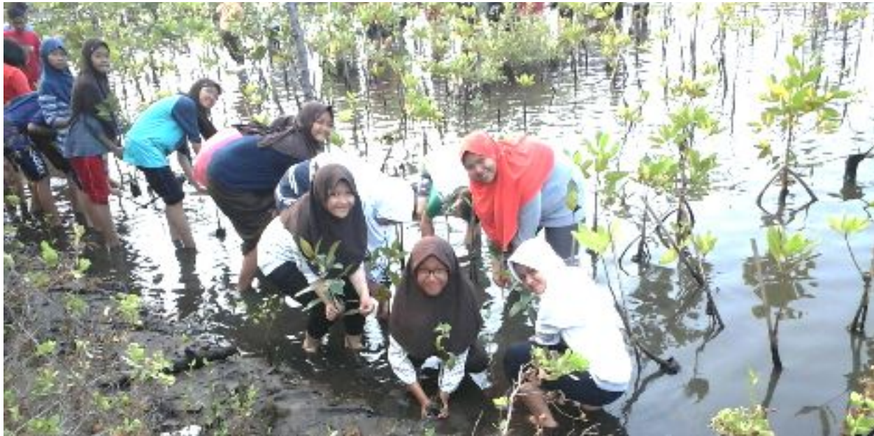
Participants of "Mangroves for Java" project, GREAT Indonesia