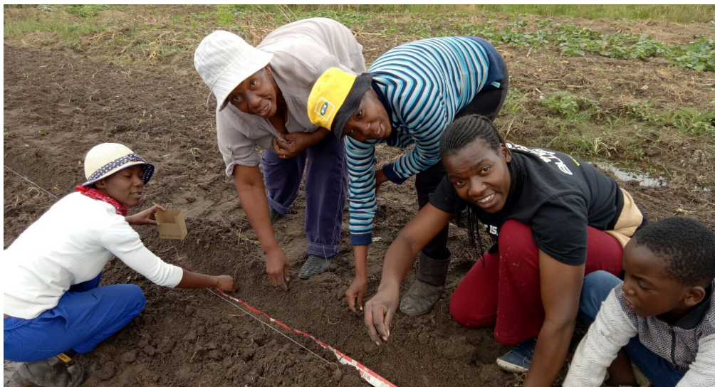
Participants of the "Community Permacultural Gardening Project" at work, SAVWA South Africa