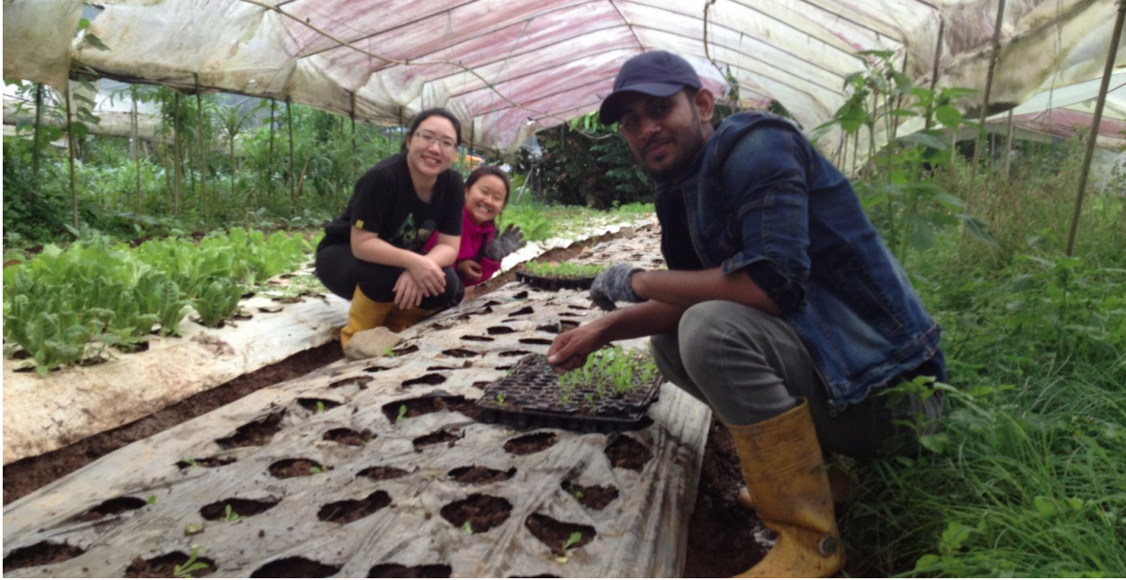
Participants of "Organic Farming for Sustainable Living" project in a nursery, SCI Malaysia