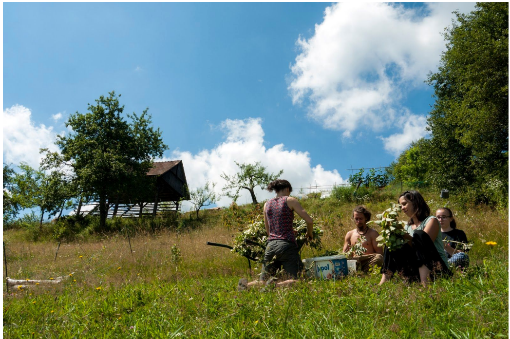
Participants of "Live Differently" helping at an ecological farm, Zavod Voluntariat Slovenia