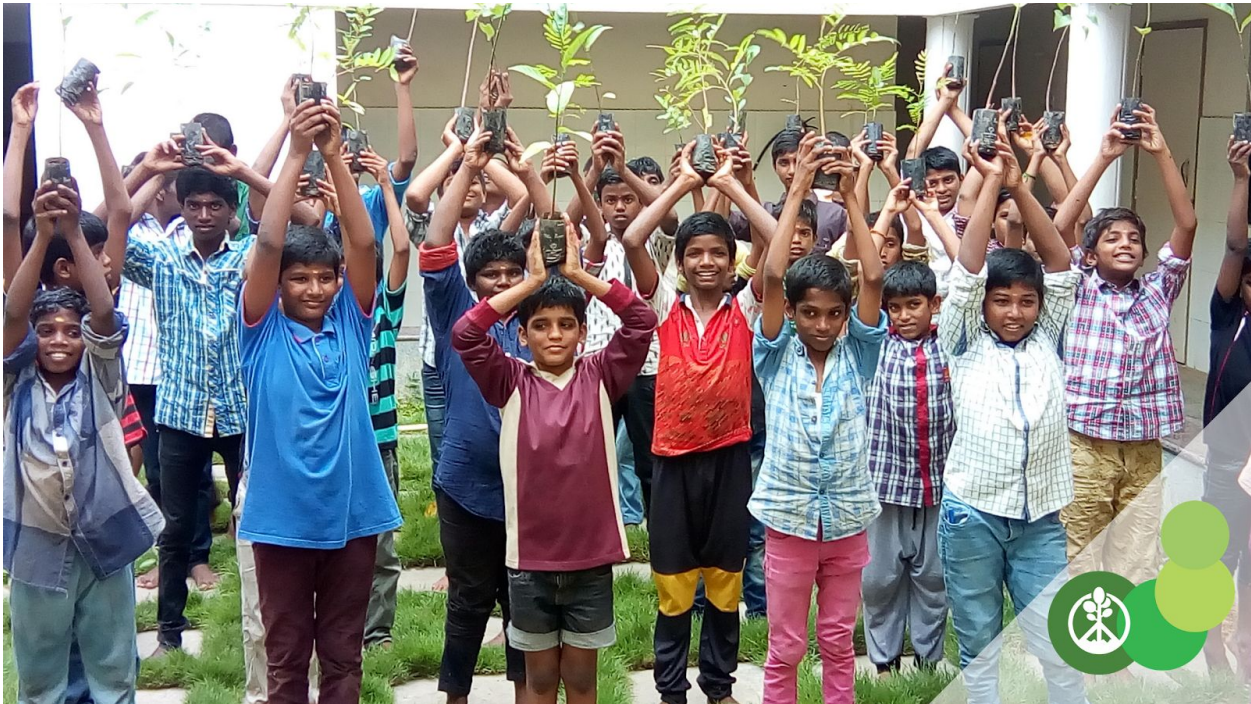
Participants of "Awareness of Global Warming Amongst Children" project, SCI India