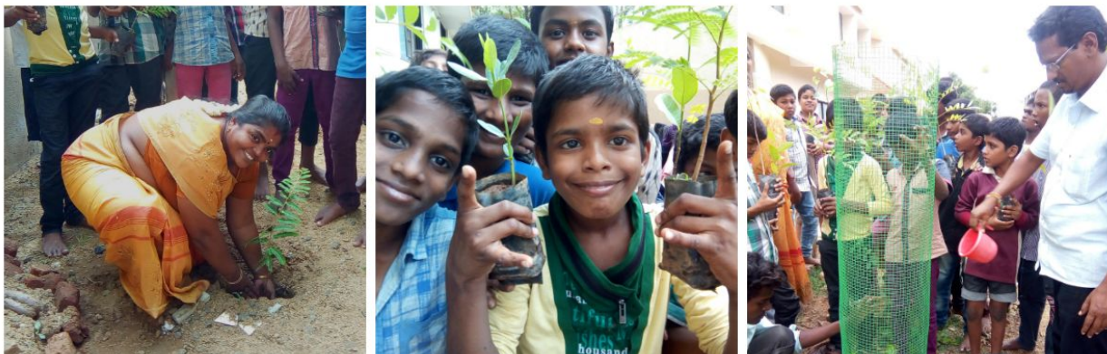
Participants of “Awareness of Global Warming Among Children” project during tree planting action, SCI India