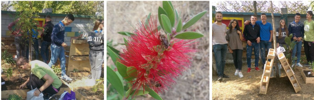
Participants of "Garden To Bee" project building pollinator hotels, PVN Albania

One of the projects which was not assessed positively failed to provide answers to clarifying questions sent by the Programme Coordinator. The other project did not fit either of the two funding windows.