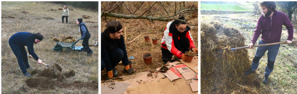
Participants of the "Planting an Edible Forest in Kosovo" at work, GAIA Kosovo

Popularity of food sovereignty Phase 5 saw an increased diversity in topics of submitted applications, ranging from pollinators protection and combating food waste, to innovative water harvesting and mitigation of coastal or erosion. Still, activities related to food sovereignty and various aspects of gardening remain the most popular and increase in their creativity.