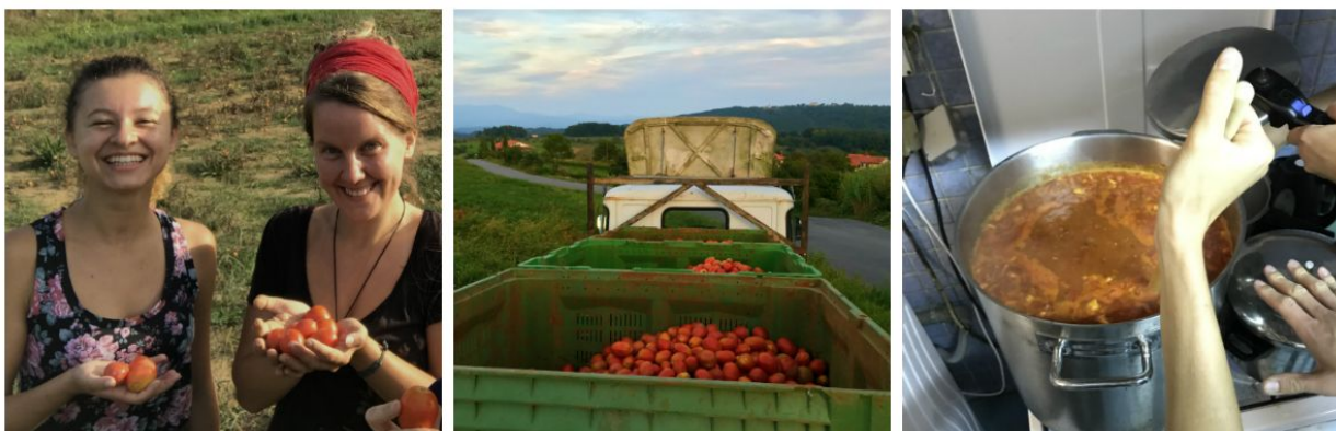
Participants of "From Food Waste to Taste" harvesting tomatoes and cooking salsa, Zavod Voluntariat (SCI Slovenia)

In Phase 5 the number of projects in the two funding windows was not as balanced as in the past phases. This is because the programme team saw many projects that fit both funding categories at the same time. They remained assigned to the funding window indicated by the project organizers, but as a result division of funds between the two funding windows was less strict than in the past.