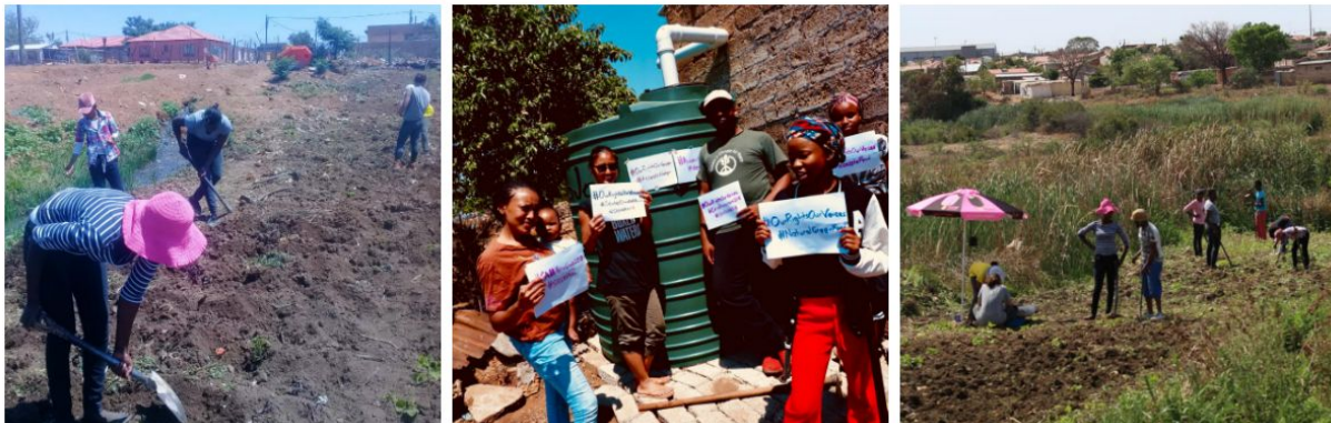
Participants of the "Water Harvesting Project" preparing water capture and irrigation system, SAVWA South Africa

The twelve implemented projects were supported with the total of €5,250. Terra21 Foundation matched financial contribution from SCI 4:1. Ivo Knoepfel from Terra 21 Foundation remained in contact with the project team and provided feedback to inspire further developments. Administrative costs were covered from SCI's internal funds.