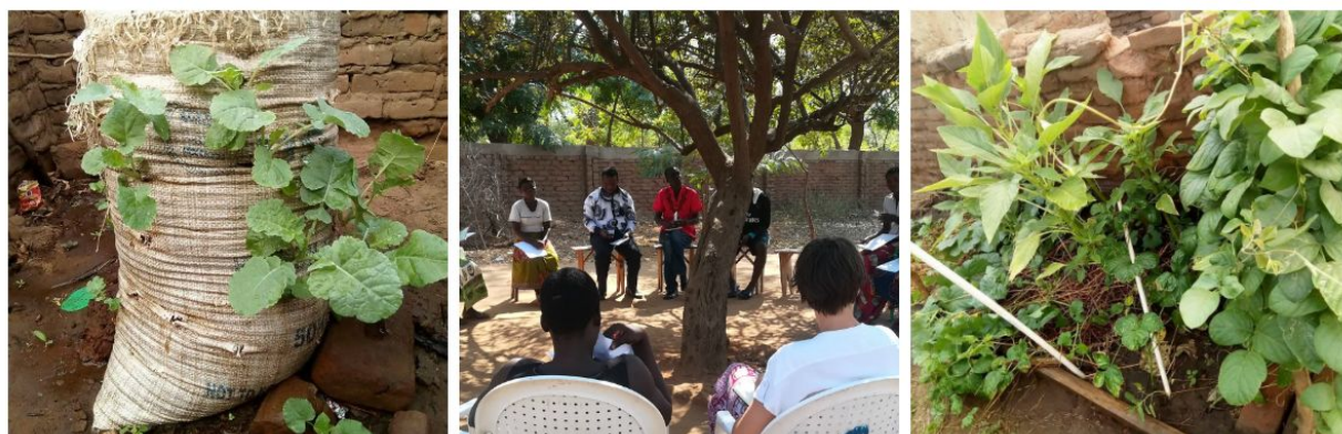
Examples of planters and a workshop during the “Backyard Gardening for Sustainable Nutrition and Food Security” project, SURCOD Malawi

Some numbers In total approximately 1200 people were directly involved in the various project activities. Over 15 gardens were established throughout the projects (including one forest garden), and close to 3500 trees were planted. Volunteers canned 50 jars of salsa made with rescued tomatoes and in all cases expressed plans for future involvement with the communities.