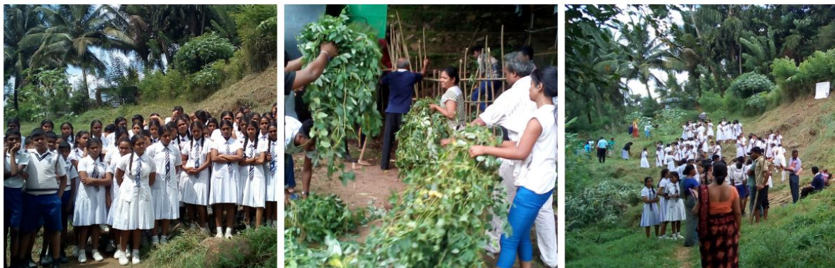
Pupils and adults "Producing Compost Using Organic Waste for Adaptation to Climate Change Impacts", SCI Sri Lanka

Other aspirations include organizing a physical meeting for the team members. The programme team has never met in person before, but there are serious reasons to believe that such meeting could really accelerate the development of the Programme. Hopefully we will also see more collaboration with the other two of SCI's seed funds as well.